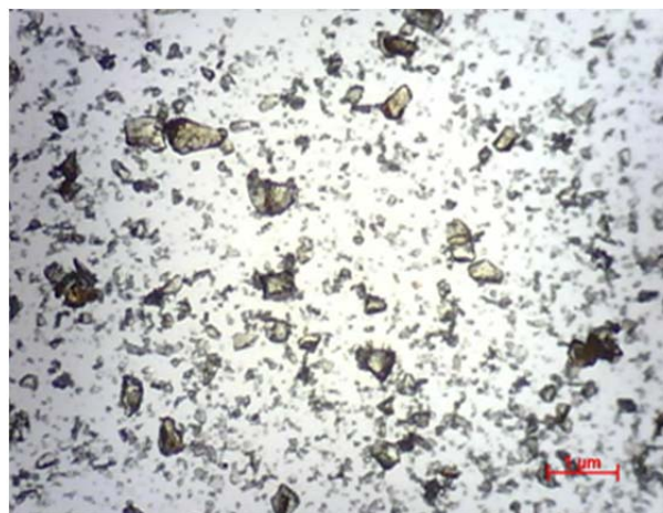
Figure 1 – Microscopy of dry extract of Zingiber officinale

The study of the shape and size of the particles of the substance (Fig. 1) indicates that the powder has a non-uniform structure with transparent particles of light brown color, which are fragments of various shapes with a smooth surface, uneven edges, capable of agglomeration, ranging in size from 0.01 up to 0.7 microns, the form factor is 0.7. The result obtained, in turn, may indicate an insufficient flowability of the powder.