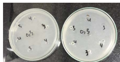
a. Inhibition of cefotaxime in 1.5% BE