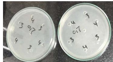
b. Inhibition of cefotaxime in 3.5% BE