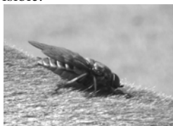
Figure 1. Female horsefly Tabanus bovinus L. sucking the blood of a horse.

Preliminary accounts showed the high number of horseflies on horses. So there were up to 32 horseflies on the horse at one point. The blood shedding of the horsefly - Tabanus bovinus is shown in Figure 1, and a massive attack of horseflies - p. Hybomitra on the udder of a horse is shown in Figure 2. In the last picture trickles of blood flowing from the wounds on the surface of the udder are visible.