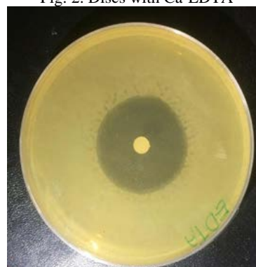
Fig. 3. Ca-EDTA alone

Also, The current results showed a clearance of tube containing gentamicin plus Ca-EDTA as compared with control positive tube (tube B.) which indicating an effectiveness of this combination, while in contrary the tubes which containing gentamicin or Ca-EDTA alone, they showed a decrease turbidity as compared with control positive tube (Fig. 4).