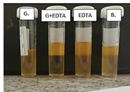
Fig. 4. Tubes with bacteria, gentamicin or Ca EDTA alone or combination

Also, The current results showed a clearance of tube containing gentamicin plus Ca-EDTA as compared with control positive tube (tube B.) which indicating an effectiveness of this combination, while in contrary the tubes which containing gentamicin or Ca-EDTA alone, they showed a decrease turbidity as compared with control positive tube (Fig. 4).