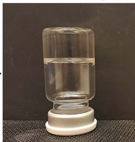
Fig.ii: Sol-Gel Transition of Poloxamer 407