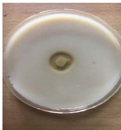
Figure (3): Proteolytic activity of a proteus mirabilis isolate after incubation on skim milk agar at 37°C for 24hrs.