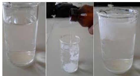
Fig.1: example of in-situ gel

chains to form matrix structure. This gelation involves the formation of double helical junction followed by re-aggregation of double helical segments to form a three dimensional network by complexation with cations and hydrogen bonding with water.