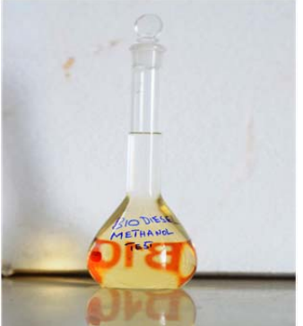
Figure-1 Biodiesel showing the clear bright phase after Methanol test