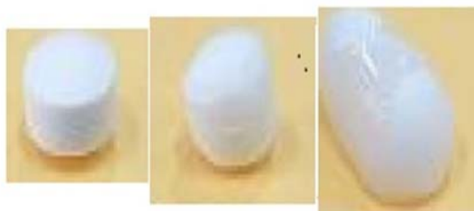
Fig.1: Water uptake study showing Swelling property of HPMC