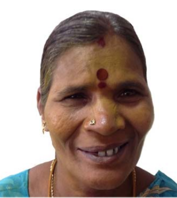
Fig 2. Smiling-deviation of corner of mouth

Lab investigations, imaging (chest x-ray) were done and were within normal limits. Magnetic resonance imaging (MRI) and contrast enhanced Computed Tomography (CT) of the brain showed normal study. On examination other cranial nerves V, VI, IX and X were intact. Patient was diagnosed as having bell's palsy (unilateral facial nerve paralysis) of the right side (lower motor neuron lesion) with the House-Brackmann facial nerve grading as Grade III moderate dysfunction.