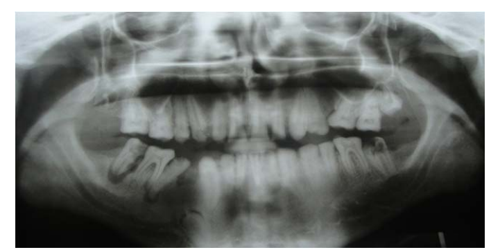
Figure 3 Panoramic radiographs showing all permanent teeth with coronal intrapulpal calcifications, multiple periapical abscess and 44 unerupted teeth had large well-defined pericoronal radiolucencies.