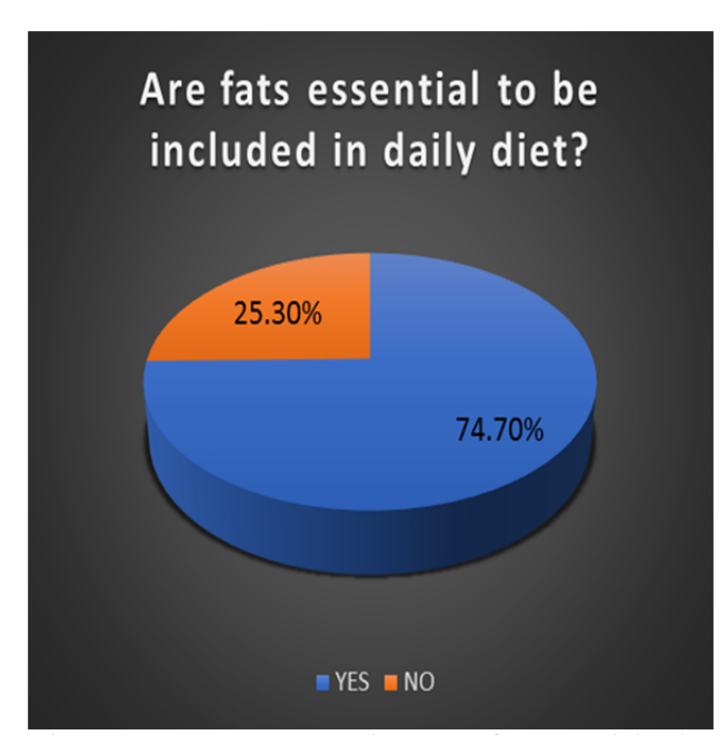
Figure 3: Response to question: "Are fats essential to be included in daily diet"?

Although majority of the participants 65 (86.7%) have heard about balanced diet, there are still a few of them who have not heard and understood the importance of balanced diet. In a study conducted in Bijapur, Karnataka(2010), the findings show that diet was considered to play an important role by 90.68% respondents and only 1.92% did not feel it was important. Khattab MS et al (1999) conducted a study among the community of Saudi Arabia, and reported that only 40% of diabetic patients had good compliance with their diet [8].