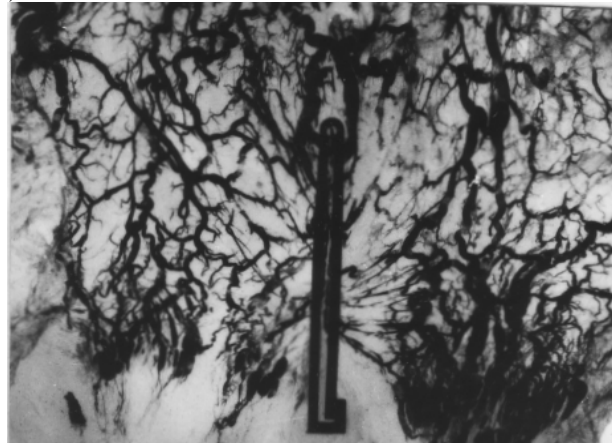
Fig. 3. Angioproctogram. Hemorrhoidal artery compressed by compression device. The knot above the clamps is cut off.

After contrasting the vascular system of the distal section of the rectum, along with compression of the hemorrhoidal artery, formation of non-vascular zones in the zone of cavernous elements was observed. Most convincingly it could be seen on angiograms with detaching of the hemorrhoidal bolus above the compression device (Figure 3).