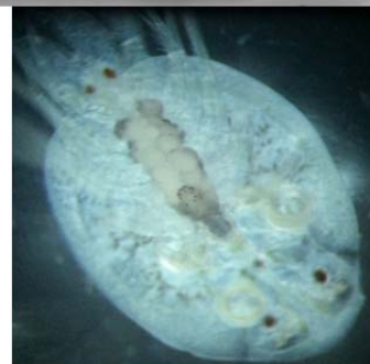
Figure 11 – Intensive damage of the abdominal part with the argulosis agent