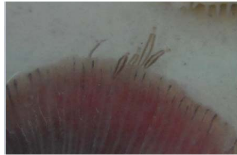
Figure 9 – Localization of D. armatum on gill filaments

and as a consequence, fish dies due to asphyxia (Figures 9, 10).