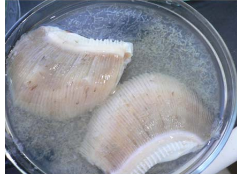
Figure 10 – High level of intense invasion level of gills

Apart from helminthiasis in sturgeons in RAS, invasion pathologies have been found, the agents of which are the representatives of arthropods ( Arthropoda ) and crustaceans ( Crustacea ).