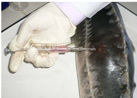
Figure 7 – Wound suspension sampling and deep pockets in the wound

The microscopy of smears colored according to Gram and made from the wound suspension revealed gram-negative rod cells morphologically identified as bacteria belonging to the Pseudomonas genus (Figure 8).