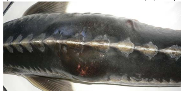
Figure 6 – Edema and ulcers of the abdominal wall side surface

There can be single or multiple ulcers. We found parallel ulcers on the side of the abdomen of sick fish. Palpation in the edema area shows fluctuation (Figure 6).