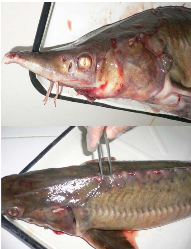
Figure 4 – Damage of dorsal denticles, crescent shaped pupil and blood stroke

Our studies show the propagation of various kinds of pseudomonas in the RAS that can initiate fish diseases. The clinical symptoms can vary and depend on the development degree of the pathological process. The initial stage of the pathological processes frequently exhibits damages of dorsal denticles, blood strokes on the sclerae and pupils becoming crescent shaped (Figure 4).