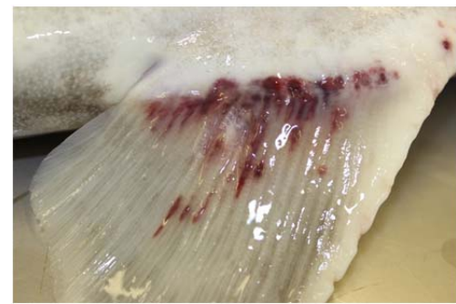
Figure 5 – Blood strokes and ulcers at the bottom of fins (fin rot)

Heavy pseudomonosis can be expressed as the abdomen swelling and ulcers penetrating deep layers of muscular tissue.