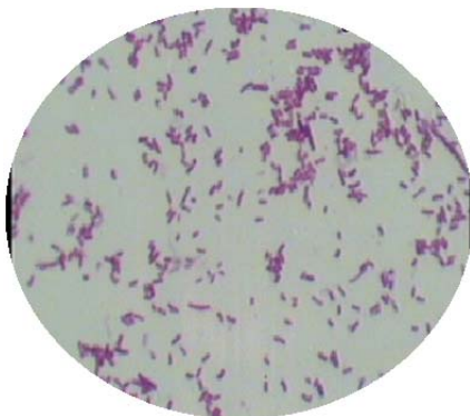
Figure 8 – Pseudomonosis agent from the wound suspension (900X)

The microscopy of smears colored according to Gram and made from the wound suspension revealed gram-negative rod cells morphologically identified as bacteria belonging to the Pseudomonas genus (Figure 8).