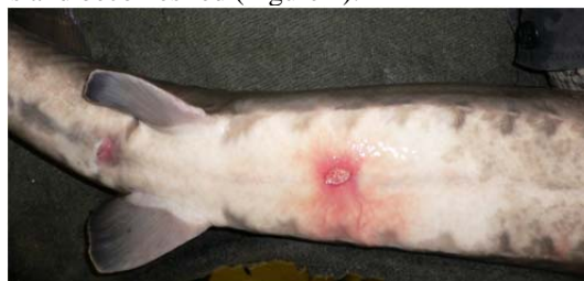
Figure 2 – Ulcer damages on the Siberian sturgeon abdominal side

Aeromonosis is an infectious disease of many fishes, including sturgeons. Aeromonosis agents are mobile aeromonads belonging to the Aeromonas genus of the Vibrionaceae family. Contamination routes are damaged skin and gills. Sick fish becomes weak, inactive, weakly reacts to external irritants, lays down on the basin bottom and stops eating. An acute form is expressed in rapid reddening of integument in sick fish, with the reddening mainly developed on the abdominal side. The anal orifice swells and becomes red (Figure 2).