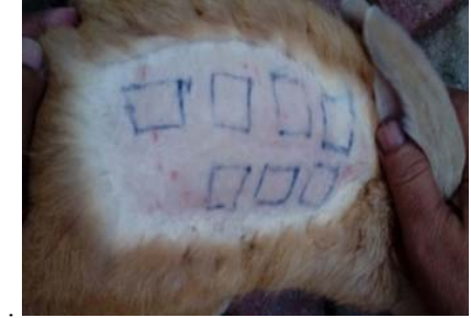
Figure 1. Sketch on the back of a rabbit

carried out for 18 days with 0.5 mL smearing every morning and afternoon. The drawing of the plastering can be seen in Figure 1.