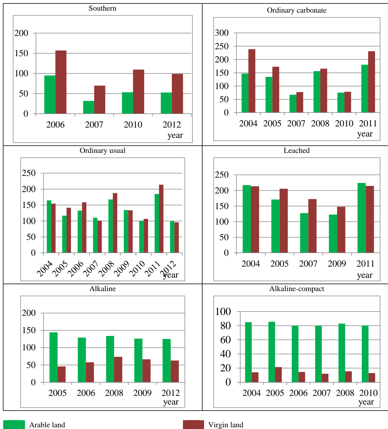
Figure 3 – The average number of micromycetes during the vegetation period by the years of research in different subtypes of chernozems, thousand CFU/1 g