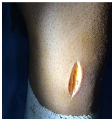
Figure 2. skin incision for harvesting of ST tendons