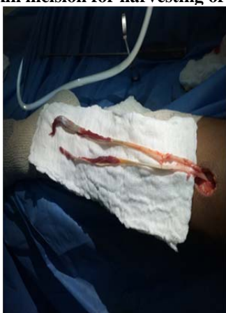
Figure 3. ST tendon harvested.