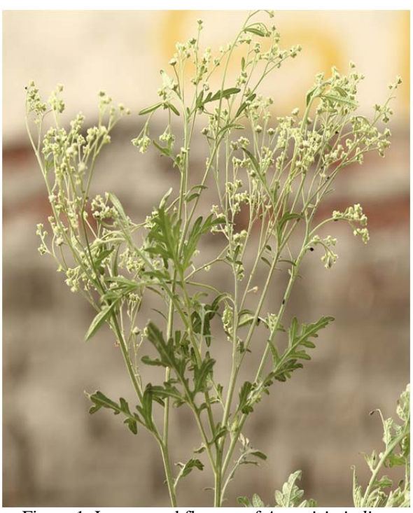
Figure 1: Leaves and flowers of Artemisia indica

mugwort and Indian wormwood are other common names for this plant [17, 19]. It has been an integral part of traditional medicine in Nepal, India, and Thailand. In Thailand, it is used for the treatment of malaria whereas in Nepal it is used for the treatment of skin and gastrointestinal diseases [14, 20]. In different regions of India, it is used as a cure for asthma, amoebic dysentery, helminthic infection and as a laxative [18]. Antimalarial compounds such as exiguaflavanone, artemisin, and maacklain have been isolated from this plant [20, 21]. Several other phytochemicals such as davanone, casticin, elemene, farnesene, oleanic acid, ascaridole and carnosol are present in this plant [14, 20, 22]. Essential oil of A. indica has shown anticancer activity in human cell lines of breast cancer, hepatocarcinoma, lung cancer and colon cancer [14, 19]. Compounds isolated from A. indica have positively modulated the GABA-A receptors in mice inferring that they can be used for the treatment of epilepsy and depression [22]. Antidiabetic, anti-inflammatory and antihelminthic properties of A. indica have been reported [23-25].