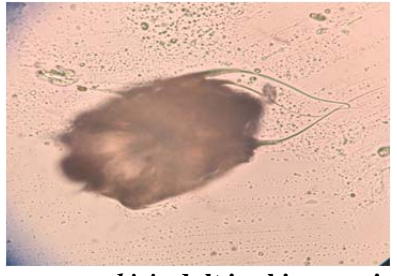
Fig. 3: Sarcoptes scabiei adult in skin scraping at (X40)